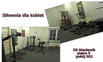
DS Akademik piętro 5 pokój 502